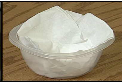
(b) In a container, or