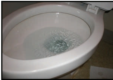
(a) In toilet , or